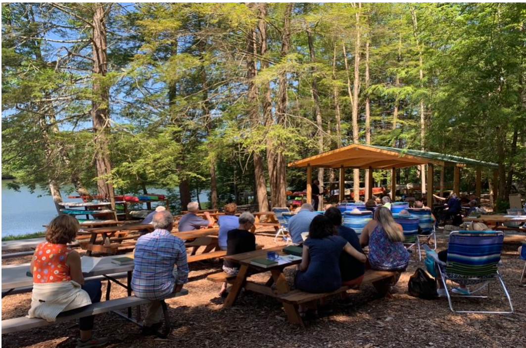
July 8 worship service